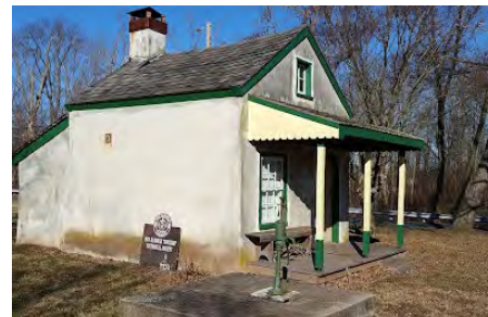
853 Swamp Creek One Room Schoolhouse