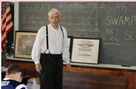
One Room School Session

Now well into our third decade, the Society has developed several avenues for preserving and presenting the history of the Township. First and foremost has been the restoration and preservation of the 1853 Swamp Creek One-Room Schoolhouse as the Society's headquarters, along with the restoration of the circa 1845 Summer Kitchen from the Dengler farm, which once occupied the land that is now Swamp Creek Township Park. The preservation and use of these buildings - and the artifacts they contain - provide direct and visible connections to a period near the midpoint of the Township's long history. Visitors are able to better appreciate their place in that story and perhaps gain a deeper sense of belonging within the community, both now and into the future.